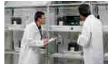
Prototype development and evaluation

To ensure the quality and superior performance of our batteries, Trojan applies the most rigorous testing procedures in the industry to test for cycle life, capacity, charger algorithms and both physical and mechanical integrity. Trojan's battery testing procedures adhere to both BCI and IEC test standards. Trojan's state-of-the-art R&D facilities include charger characterization and analytical labs, battery prototype and evaluation labs and battery autopsy centers all dedicated to providing you with a superior battery that you can rely on.